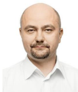
Competitors Relations Officer